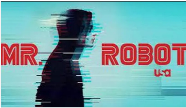
Figure 3: Rami Malek in Mr Robot (glitched) – ‘memory disruption and dislocation’.