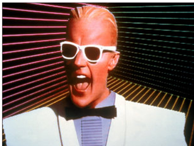
Figure 1: Looking like a 'glitched data file'. Max Headroom.

More recently, of course, glitch has emerged full blown into popular culture, perhaps lamentably collapsing the distinction between glitch as art and commercial forms which simulate or appropriate it (Betancourt 2017: 87). Nevertheless, Blade Runner 2049 seems to me to invite a reading in which glitch effects stand for more than simply appropriation of the form in an attempt to borrow authenticity. I have suggested elsewhere (Shaw, 2000) that Ridley Scott's original Blade Runner can be most productively read as a critique of hierarchies of being in that it images the effects of the collapse of distinctions on which they rely through an interrogation